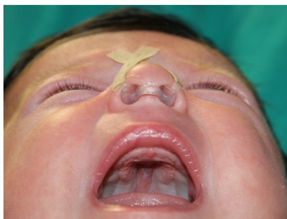
Figure 5 Post-operative picture showing the application of nasal conformers routinely applied in cleft patients.

The diagnosis of CNPS is based on clinical evaluation, including nasal endoscopy and especially CT. The inability to pass a 5F catheter and a radiographically measured pyriform opening <8–10 mm in a full-term infant are considered diagnostic. If holoprosencephaly is suspected by the presence of a central maxillary incisor, encephalic CT or magnetic resonance imaging should also be performed [6-8]. Once the diagnosis has been confirmed, the treatment approach must take into account the severity of the clinical condition, any associated comorbidities, and the neonate's global prognosis.