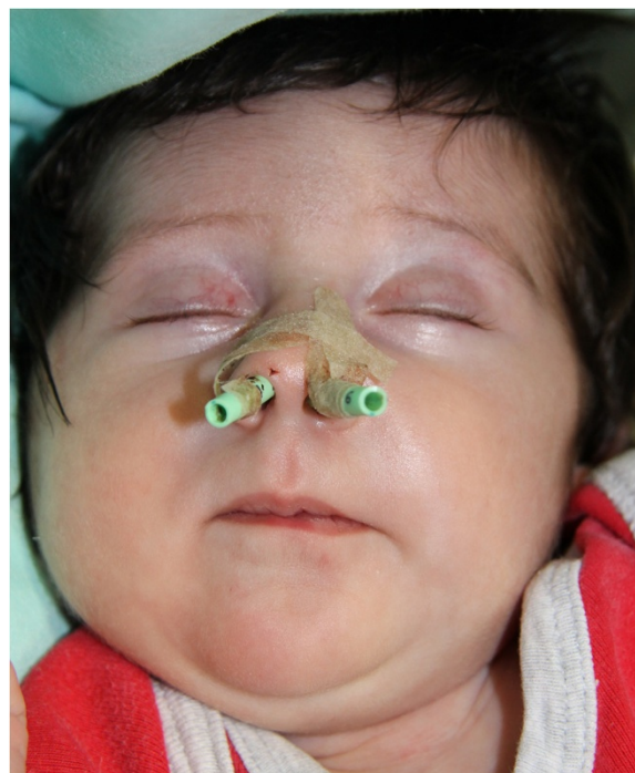
Figure 3 Post-operative picture showing the nasal silastic stents applied fixed to the columella.

The infant was maintained on decongestant drops for several days with a reasonable respiratory result, but experienced difficulties in feeding and failure to thrive.