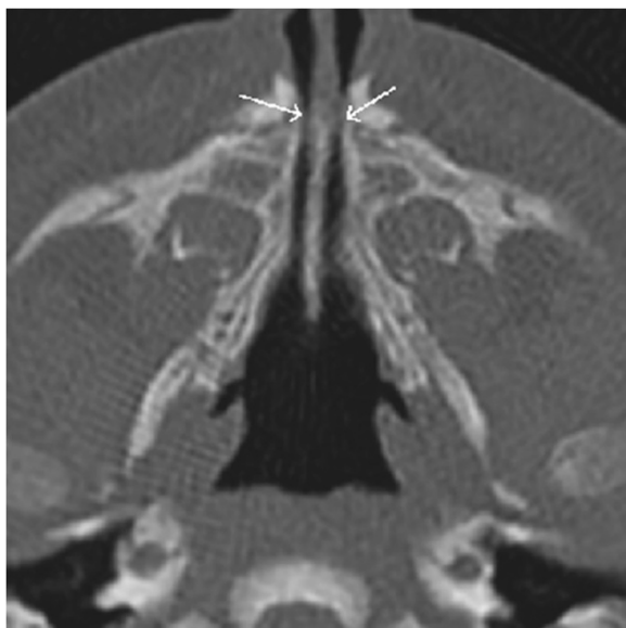
Figure 1 Pre-operative CT scan showing the nasal pyriform aperture stenosis.

showed a normal right nasal fossa and left choanal stenosis. Computed tomography (CT) revealed stenosis of the pyriform aperture (5,3 mm diameter) and choanal atresia (Figure 1).