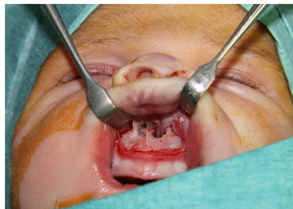
Figure 2 Intra-operative picture showing the enlargement of the pyriform aperture obtained with surgery.

A full-term female infant had Apgar scores of 5 at 1 min and 9 at 5 min after birth. Her weight was 3.520 kg,