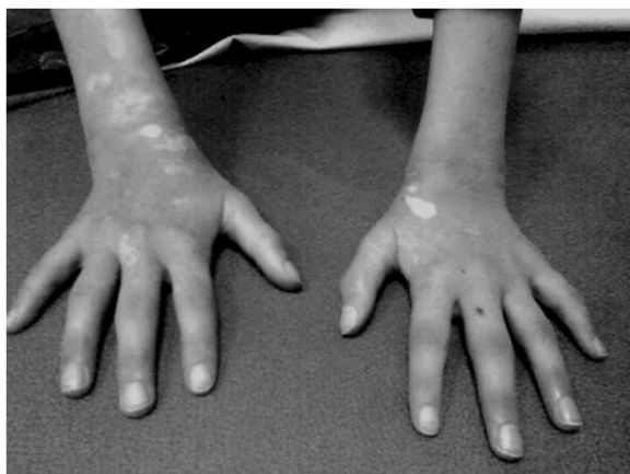
Figure 2 Symmetrical arthritis of proximal interphalangeal, metacarpophalangeal and radiocarpal joints (also, note vitiligo).

next 6 months several relapses of arthritis were observed so hydroxychloroquine as disease-modifying antirheumatic drug (DMARD) was given.