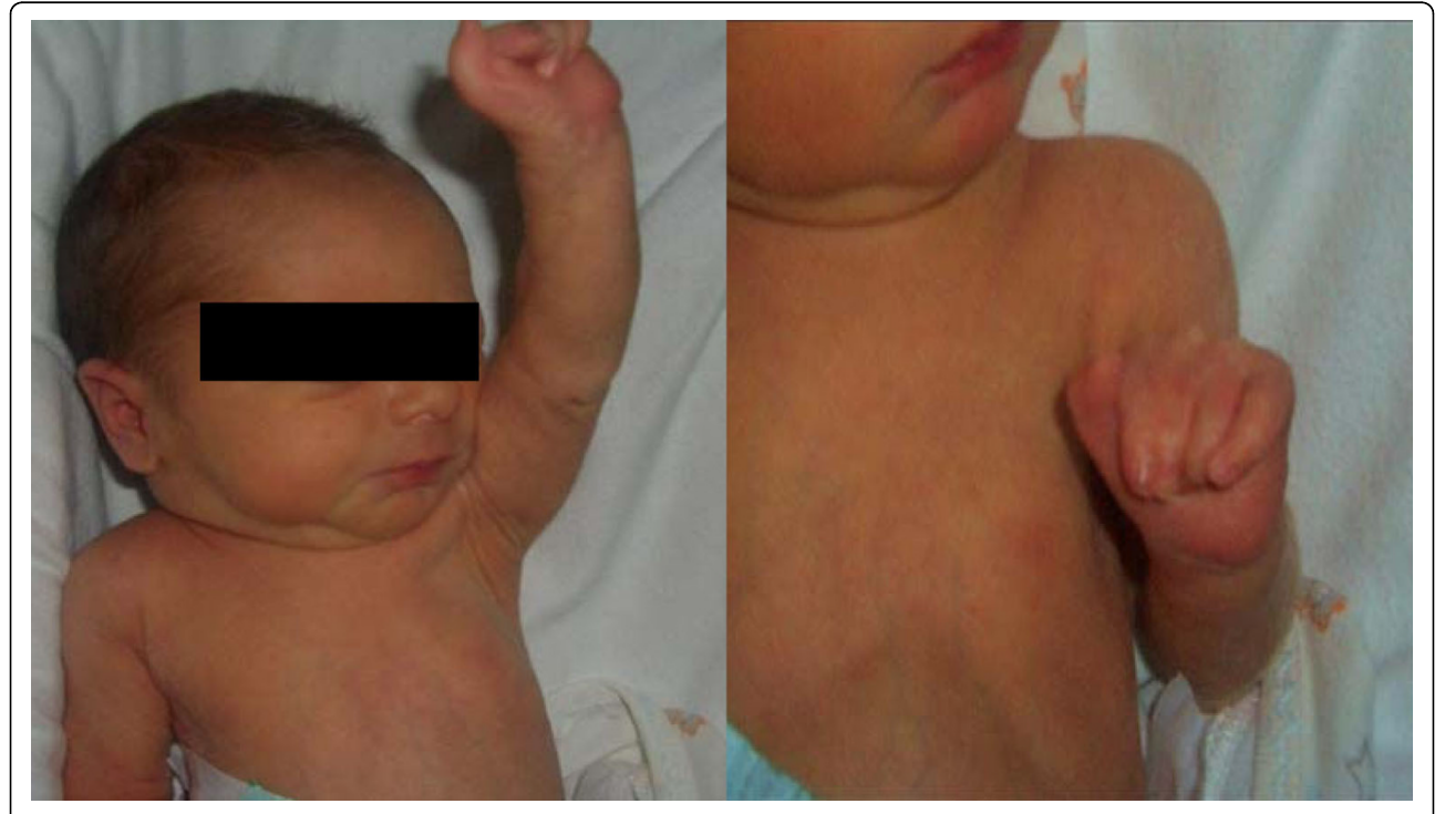
Figure 1 Depression of the left anterior chest wall (1a); brachysyndactyly of the second, third and fourth finger of the left hand (1b).

Because both isolated dextrocardia and PS are very rare, in accordance with other Authors [6-9], we believe that the relationship between dextrocardia and PS is not a coincidence; in particular dextrocardia might follow the loss of volume of the left hemithorax caused by the development of the Poland sequence. In a recent study [10], all patients with left sided PS and partial agenesis of two or more ribs presented dextrocardia, whereas it was never associated with partial agenesis of a single rib. These findings suggest that mechanical factors during embryonic life could explain the association between left-sided PS and dextrocardia; in particular partial agenesis of 2 or more ribs is needed to displace the heart towards the right side.