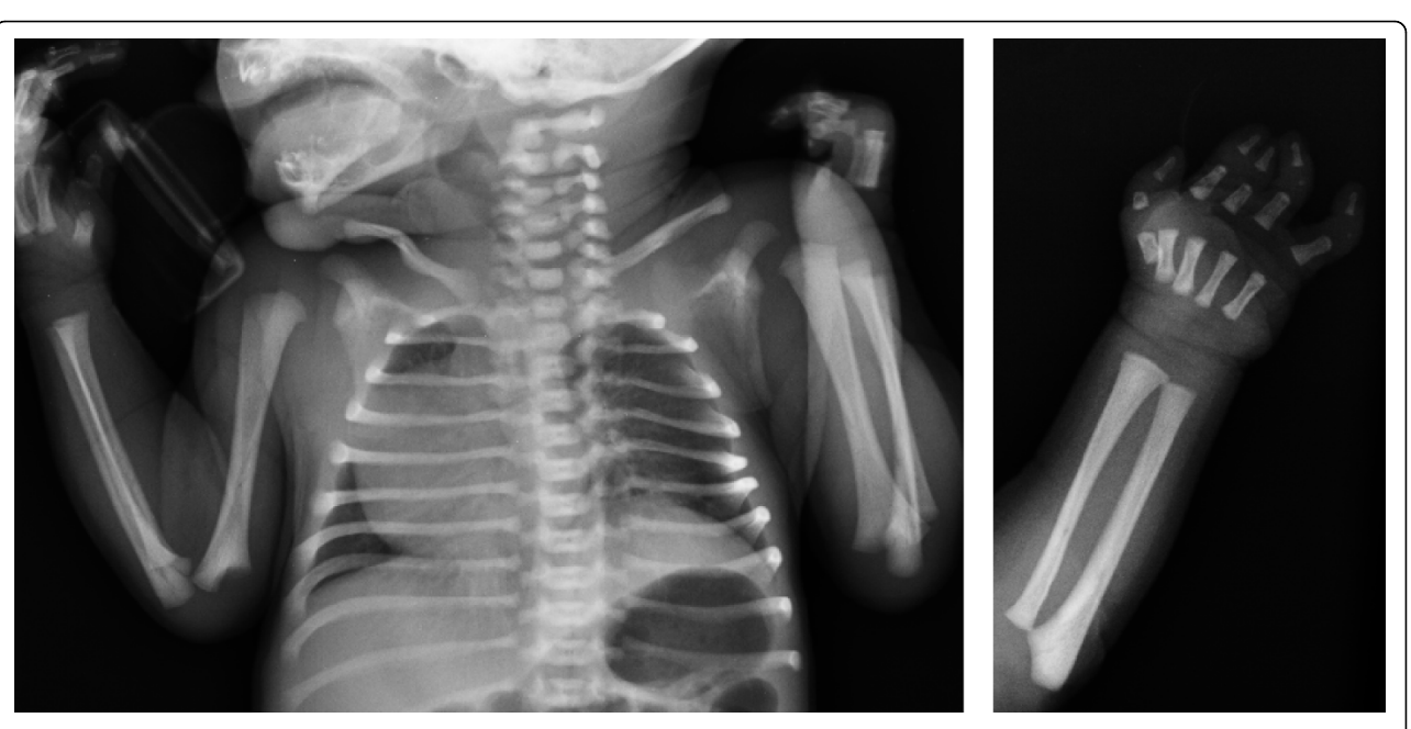
Figure 2 Chest X-ray: asymmetric chest with reduction of the third to fifth left intercostal spaces and dextrocardia (2a). Left hand X-ray: hypoplasia of the main phalanx of the I finger, absence of the intermediate phalanx of the II and III fingers, and substitution of the intermediate phalanx of the IV and V fingers with a small ossification nucleous (2b).

The fact that dextrocardia in PS is neither associated with situs inversus, nor with other complex anomalies, further supports this hypothesis.