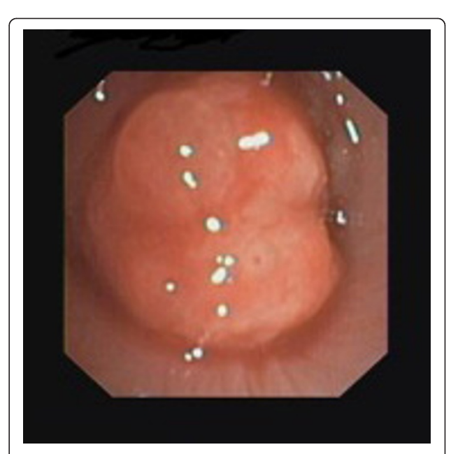
Figure 5 Endoscopy: mass occluding 70% of the tracheal lumen.

persistent dysphonia, dysphagia and grade 4 transglottic stenosis. Extended CTR with a new tracheostomy were performed and endoluminal LT-Mold stent (Bredam S. A., St. Sulpice, Switzerland) was positioned. The endotracheal tube was removed on the 3<sup>rd</sup> post-operative