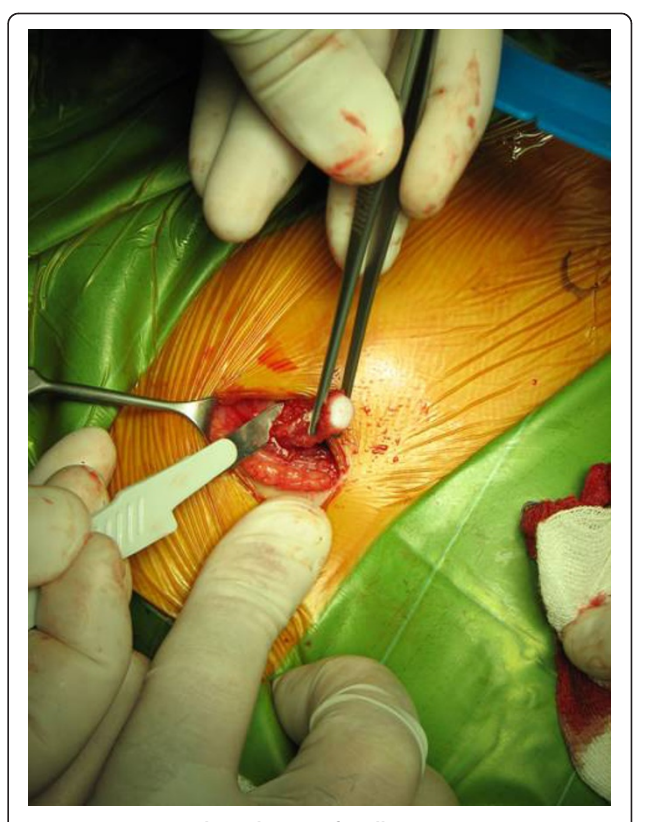
Figure 1 LTP: costal cartilage graft collecting.

We adopted the Myer-Cotton classification of subglottic stenosis [1] into 4 degrees depending on the percentage of lumen occlusion (table 1). Laryngotracheoplasty (LTP) consists in the enlargement of the lumen of the airway by inserting a costal cartilage graft (usually in the anterior wall) (Figure 1 and 2). Cricotracheal resection (CTR) consists in the resection of the stenotic tract, including the anterior ring of the cricoid and the involved tracheal rings, and the anastomosis between the thyroid cartilage and the first unaffected tracheal ring (Figure 3 and 4). Indication for LTP was a grade 2 stenosis while indication for CTR was a grade 4 stenosis.