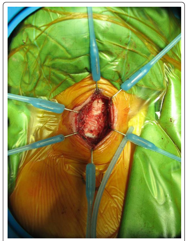
Figure 2 LTP: the cartilage rib has enlarged the anterior wall of the airway.

Grade 3 stenoses were treated by LTP or CTR, depending on the surgeon's preference. Extended CTR was indicated in the treatment of transglottic stenosis which extends from above and below the glottis and involves the vocal chords. Extended CTR also included opening