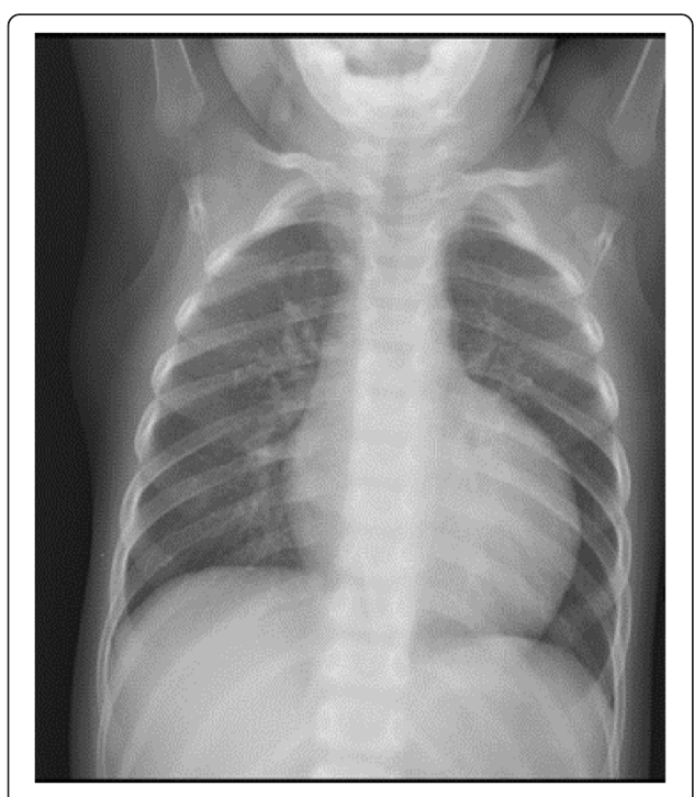
Figure 1 Chest X-ray showing severe cardiomegaly.

The patient was admitted again at the age of 24 months for febrile neutropenia (ANC: 400/mm<sup>3</sup>). His body measurements were still at the lower percentile for age: weight 10.4 Kg (3rd percentile) and height 82.5 cm (3rd percentile). Analysis of the growth charts confirmed the progressive growth delay. Auscultation revealed wheezing and crackles; pulse oximetry was 96%. Cardiac examination was unremarkable with a heart rate of 125 beats/ minute and arterial pressure of 83/49 mmHg. Abdominal evaluation revealed hepatomegaly. Chest radiography ruled out pneumonia but revealed the presence of cardiomegaly (Figure 1). Echocardiographic evaluation documented dilated CMP, with marked enlargement of the left ventricle and severe impairment of the systolic