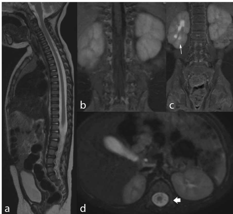
Fig. 3 MRI after conclusion of chemotherapy. Three planar T2WI (a, c, d) and coronal T1WI (b). The exam shows complete regression of the tumor at both intra- and extraspinal compartments. Mild pyelectasia was detected in the right kidney

Children diagnosed with neuroblastoma presenting with symptoms of EC have an excellent outcome in reason of the favourable location of the primary tumour and the rare metastatic spread [1–3]. Children at this age usually have favorable biologic features (in particular, a single copy of MYCN oncogene, and no abnormal 1p and 11q chromosomes) [17, 20], and are thus excellent candidates to cure. Although adequate studies could not be performed due to the insufficient amount of tumour