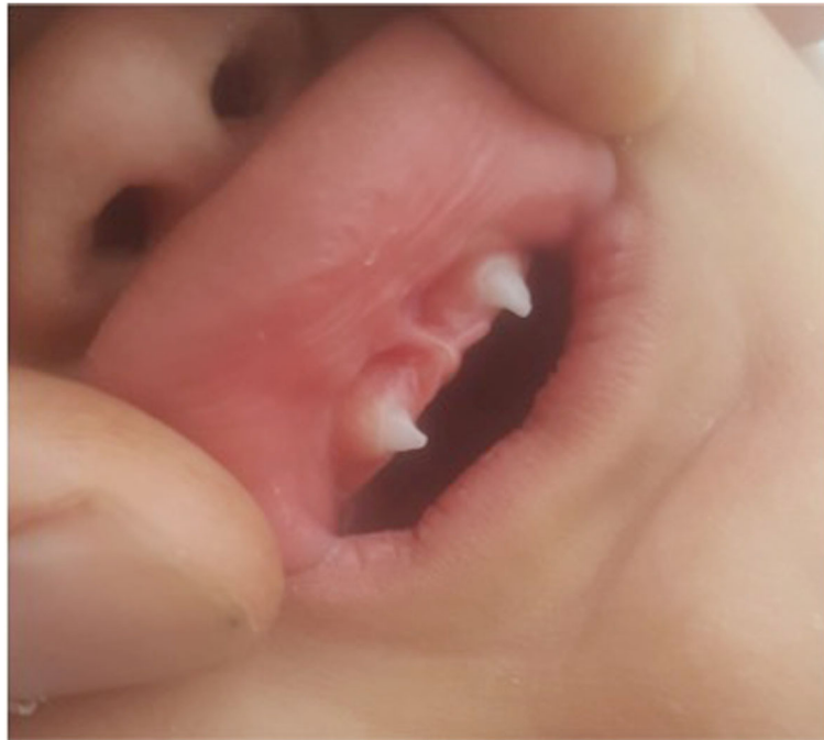
Fig. 3 Severe oligodontia. Two conical anterior teeth and a wide midline diastema

VUS may or may not be disease-causing or associated with increased risk of an abnormal phenotype; the identification of a variant of uncertain significance does not confirm or exclude a diagnosis. A VUS does not meet the criteria to be classified as pathogenic or benign [23].