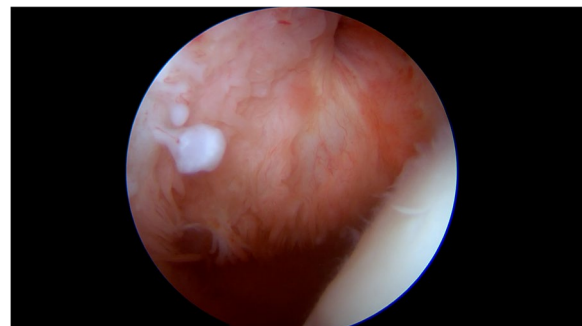
Fig. 3 A sessile cartilaginous body arising from the synovial membrane