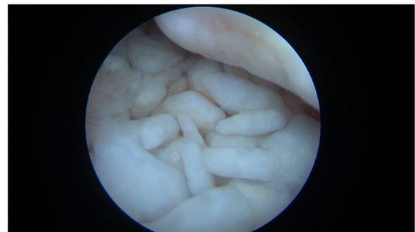
Fig. 2 Arthroscopy of the right shoulder: white calcific loose bodies within the articular space