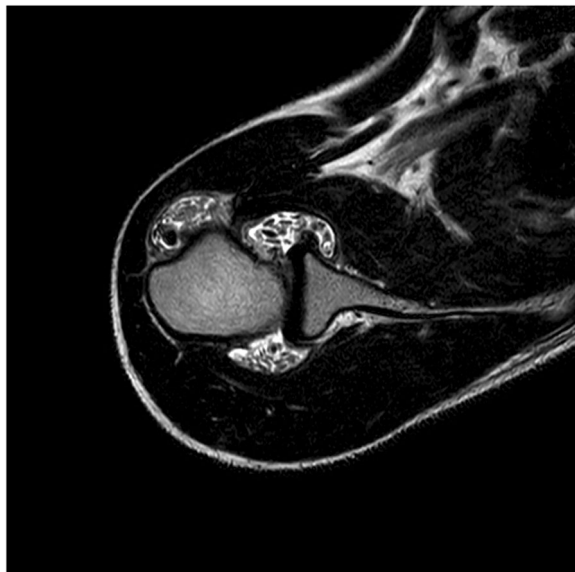
Fig. 1 T2-weighted MRI shows a pronounced effusion of the shoulder joint, especially the subacromial bursa and axillary recess. Multiple hypointense lesions are present within the articular space

A synovial chondromatosis was suspected, therefore the patient underwent arthroscopic surgery of the right shoulder under general anesthesia and peripheral nerve block. In the intra-articular phase of arthroscopic surgery, multiple white, shiny loose bodies were found within the articular space and were removed along with the inflamed synovial membrane (Fig. 2, an additional movie file shows this in more detail [see Additional file 1]). A few sessile cartilaginous bodies of the synovial membrane were also noted and sent for histological examination (Fig. 3, additional file 1). The LHBT appeared healthy, and no loose bodies could be retrieved in the intraarticular, most cranial portion of the bicipital groove. Based on the MRI imaging findings, arthroscopic exploration of the subacromial space was implemented. Opening of the LHBT sheath revealed the presence of abundant loose bodies, presenting with the same macroscopic aspects of the intra-articular bodies whereas of bigger dimensions. LHBT sheath synovitis was also detected (Fig. 4, an additional movie file shows this in more detail [see Additional file 2]). Histological examination of the loose bodies revealed multiple islets of hyaline