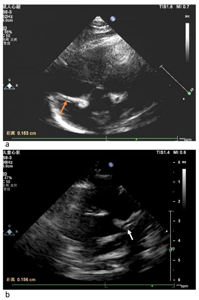
Fig. 3 Echocardiography on the 46th day of disease course. Ultrasound examination of the heart showed that coronary artery dilation was improved. a Five chamber view showing dimensions of right coronary artery. b Parasternal short axis view showing left coronary artery (4a and 4b)

At 4 weeks from discharge (day 46) the child was clinically well, weight was 6.7 kg and length was 66 cm. The echocardiography did not show evidence of thrombosis and dilatation of coronary artery was markedly improved ((LCA 1.6 mm, z-score: 0.12, LAD: 1.8 mm, z-score: 1.95, RCA 1.6 mm, z-score: 0.79). The results of echocardiography on the 46<sup>th</sup> day of disease are shown in Fig. 3. At final follow-up (7 weeks post-discharge), the echocardiogram showed LCA 2.0 mm, z-score 1.47and RCA 1.6 mm,z-score: 0.79. Platelet count progressively normalized during observation and other blood tests were repeatedly normal (Table 1).