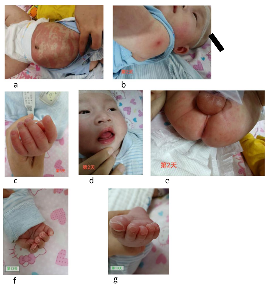
Fig. 1 Initial and late clinical signs of disease course. a and b . Sprinkled skin rash on the abdomen, trunk and limbs c . edema of the fingers d . bilateral conjuntivitis, red and dry lips, red bayberry tongue e . perianal redness f . hands desquamation g . feet desquamation

The child was admitted and an empiric treatment with IV cefotaxin was started. On the 2<sup>nd</sup> day of admission, the child was still febrile (39.5 °C) with increased irritability, abdominal distension and cold extremities and rash spread to the face and trunk. Swelling and redness of the hands and feet, lips and oral mucosa redness (strawberry tongue), bilateral conjunctivitis and perioral redness became evident, as shown in Fig. 1 a-e. Repeated blood tests revealed raised pro-calcitonin (7.676 ng/mL), slightly increased liver enzymes (ALT 89 U/L, AST 44 U/L) and mild hypoalbuminemia (30.6 g/L). Leukocyturia (white blood cells 3+) and proteinuria (582.6 ul) were evident at urine analysis. The main infective causes were excluded, including TORCH, EBV, gastrointestinal infection (normal stool culture and viral investigations), upper respiratory tract infection (negative pharyngeal swab). COVID serology was negative, such as blood and urine cultures. Mild signs of pulmonary inflammation were found on chest X-ray. Antibiotic treatment was switched