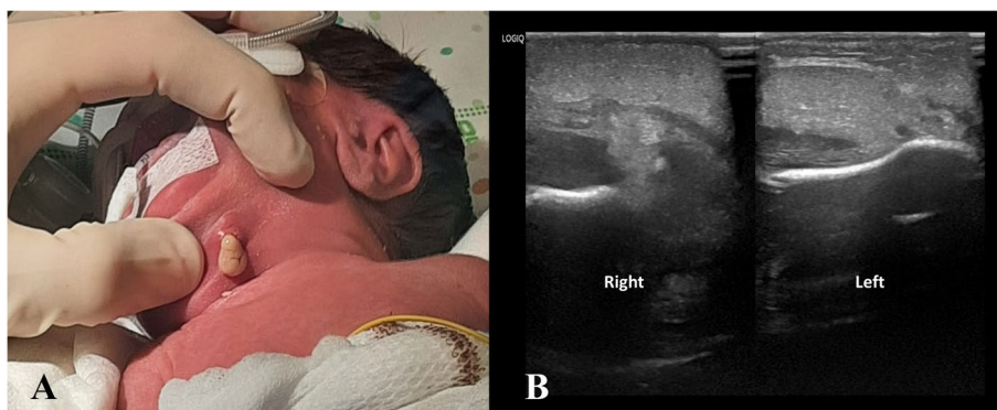
Fig. 2 Case #2 drainage of abundant purulent material from the lesion sited in the right submandibular area (A). Ultrasound scan with the evidence of tissue inflammation extended up to the subfascial latero-cervical area in the right cervical side, compared to the normal left one (B)

Due to the importance of a proper microbiological control within the NICU, many clinical and epidemiological reports on dermatological and soft tissue infections