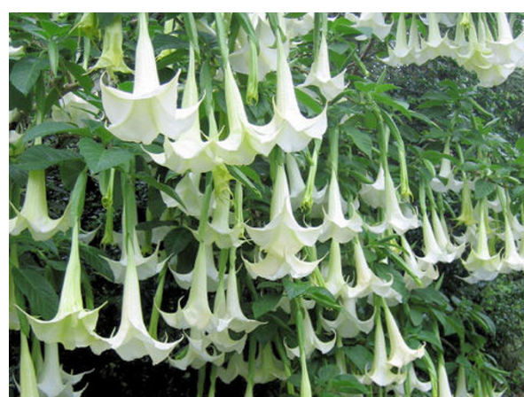
Figure 2 Datura suaveolens .

Our patient had no neurologic symptoms, there was no ptosis nor an ocular motility deficit. However, a cerebral MRI was performed to exclude a compressive origin of palsy even if the level of suspicion of this cause was very low.