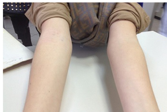
Figure 1 Etanercept led to a marked improvement in arthritis.