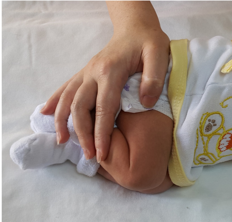
Fig. 2 The infant in the facilitated tucking position

mean, chi-square test, independent samples t -test, and Cronbach's alpha coefficient calculation, as well as the kappa test for agreement analysis among independent observers, were used to assess the data. The results were assessed at a confidence interval of 95 % and with a significance level of p < 0.05 .