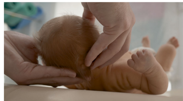
Fig. 1 Cranial Base Molding Technique applied in the intervention group

If distribution was normal, the Student t-test for independent samples was used for the intergroup comparisons