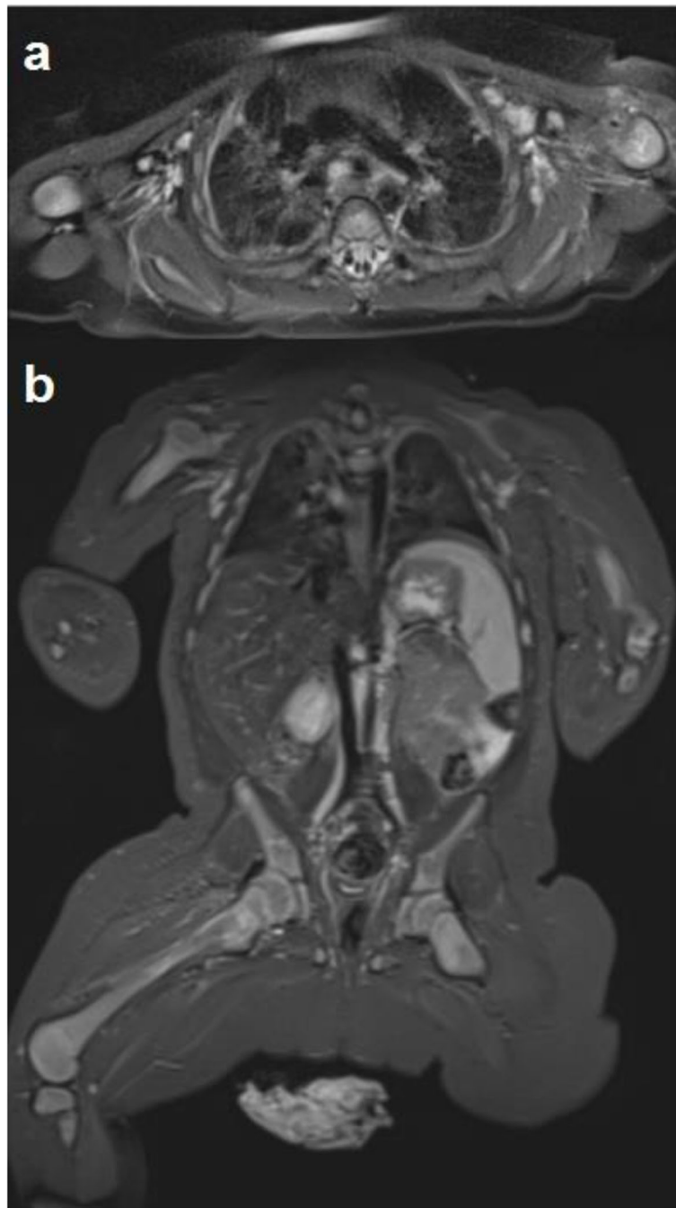
Fig. 2 a-axial and b-coronal STIR MR images performed about 1 month later showed complete resolution of muscular involvement and improvement of lungs and bone flogistic involvement

In our patient WB-MRI was really helpful for the detection and location of multifocal flogistic processes and was a valid and sensitive tool during the follow-up period, without radiation exposure of the child. Whole-body MRI is a fast and accurate modality for detection and monitoring of disease throughout the entire body with a variety of applications in the paediatric patient population [25].