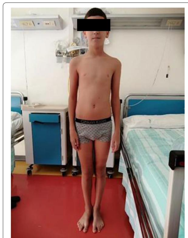
Fig. 1 Anterior view: Poor muscle mass in a boy with normal stature

respectively. At this time, the patient was referred to the Center for Metabolic Diseases of the Salesi Children’s Hospital, Ancona, Italy, for further evaluation. On admission, the child appeared in good general condition. He did not show developmental delays nor appreciable dysmorphic features. He weighed 41 kg (3 rd p), and was 156 cm tall (90 th p). On physical examination, the patient had diminished muscle mass with normal muscle tone and mild dorsal-lumbar right convex scoliosis (Figs. 1 and 2). He did not show any motor limitations, but only mild diffuse myalgia, mainly in the lumbar area. He did not present hepatomegaly. Laboratory examinations revealed the following values: hemoglobin 11.1 g/dl; hematocrit 32.9%; MCV 83 fl, white-cell count 8310/mmc and platelet count 272,000/mmc. The CPK concentration was markedly elevated (14,000 U/l). The levels of the following were also abnormal: AST 465 U/l; ALT 375 U/l; lactate dehydrogenase 542 U/l (normal 0–325). Urinalysis and arterial blood gas analysis were normal. During hospitalization, the child presented two more critical episodes. The first episode occurred in the early morning, during sleep, in apyrexia. He presented with generalized tonic–clonic seizures which resolved after administration of rectal diazepam. Laboratory examination revealed severe metabolic acidosis (Ph 7.2, HCO 3 - 19 mmol/l,